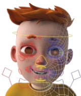
CRÉDITS : LE BONHEUR DES UNS