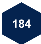
Students earning more than Average Salary