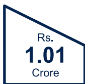
All Time Highest Salary