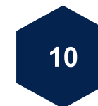
Highest Increase in Salary of Experienced Student

Average Increase in Salary of Experienced Student