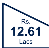
Average Salary (Top 25%)