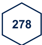
Companies Visited Campus

Students earning more than Average Salary