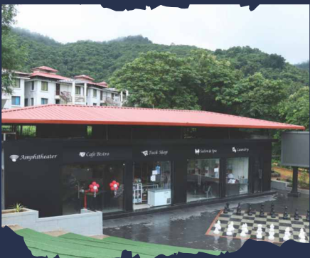
PLAZA WITH OPEN AIR THEATRE