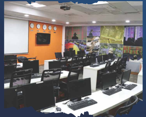
GLOBAL ASSET TRADING ROOM