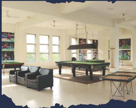
INDOOR SPORTS ROOM