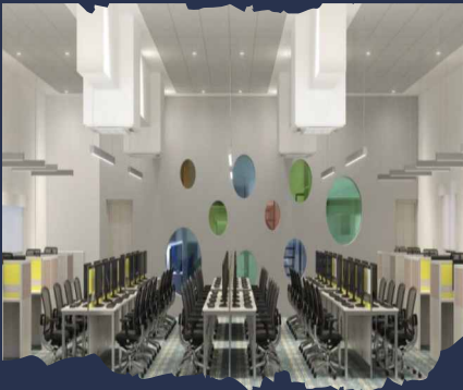
QUANTUM COMPUTING LAB