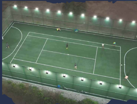
FUTSAL & TENNIS COURT