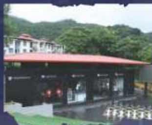
PLAZA WITH OPEN AIR THEATRE