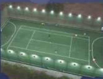
FUTSAL & TENNIS COURT