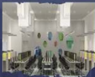
QUANTUM COMPUTING LAB