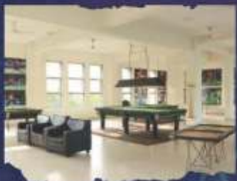
INDOOR SPORTS ROOM