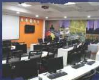
GLOBAL ASSET TRADING ROOM